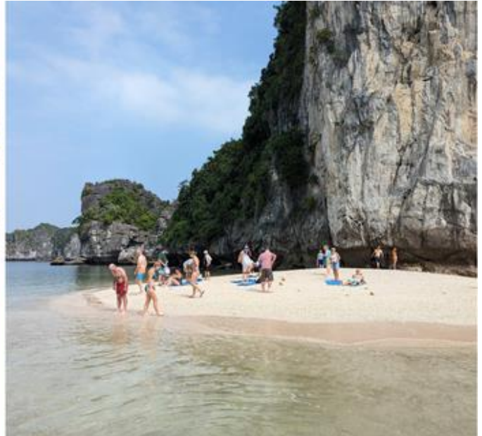
Ti Top Island

16:45 Back to the cruise. Relax and enjoy sunset on the sun deck. Cruising to the overnight anchorage