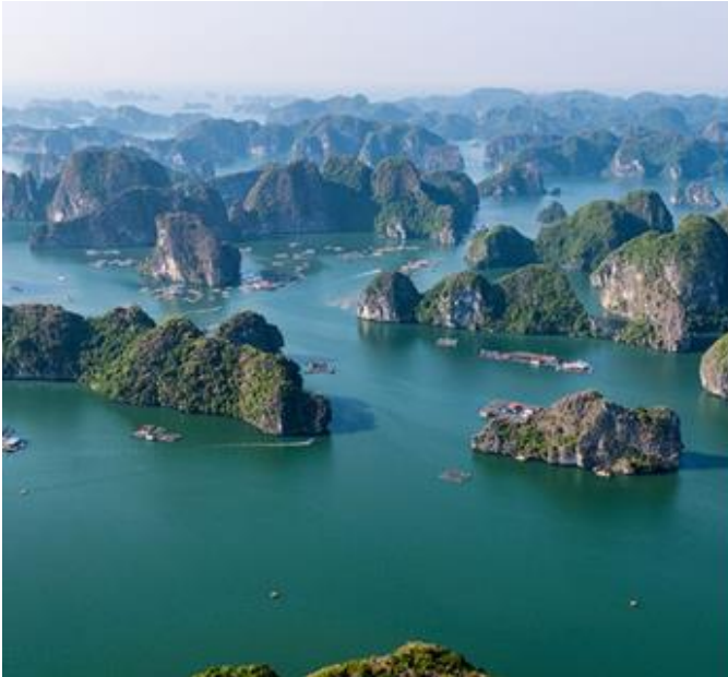
The overview of Ha Long Bay

15:45 Leaving Surprise cave, transfer by tender to the Titov Island. Enjoy swimming, relaxing on the beach or climb the steps of the rock to the top of the island for photo taking. On the top of the mountain, you can see a corner of magical Halong Bay.